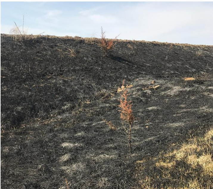
Singed cedar trees after a prescribed burn in a county roadside. Prescribed burns are a cost-effective way to control trees and shrubs before they form large stands.

An LRTF grant can help fund a roadside vegetation inventory map for prioritizing brush control. As former Scott County engineer Jon Burgstrum said, with a roadside inventory “We have a real good base to know where the good areas are and the areas that we may need to work on.” 29 A strategic and efficient brush spraying program significantly reduces the need for mechanical brush control, which is money in the bank. If a county or city does need brush control equipment, LRTF grants can be used toward items such as wood chippers.