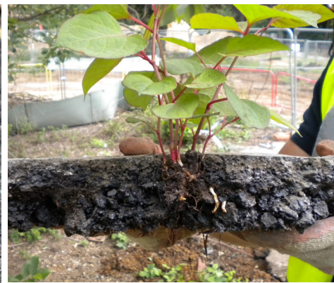
Japanese knotweed growing through pavement and in a dense stand near a road.