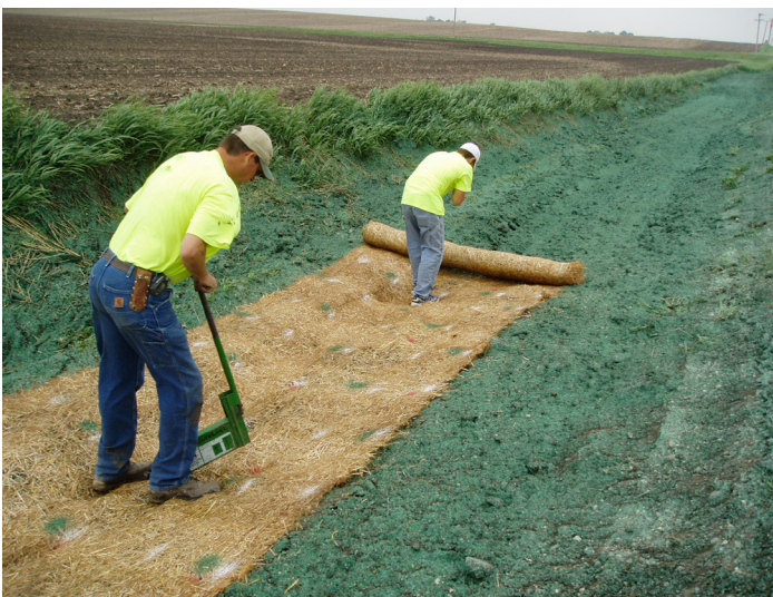
Roadside technicians install erosion mats in Dallas County.

six to nine feet deep. 30 These extensive roots make them especially suitable for reducing soil erosion, in comparison to shallow-rooted cool-season grasses such as tall fescue, with roots two to three feet deep 31,32 and smooth brome, with roots mostly in the top foot of soil. 33 According to video footage recorded by Iowa State University and the UNI Tallgrass Prairie Center, the roots of native prairie plants such as grasses do not plug tile lines. 34,35