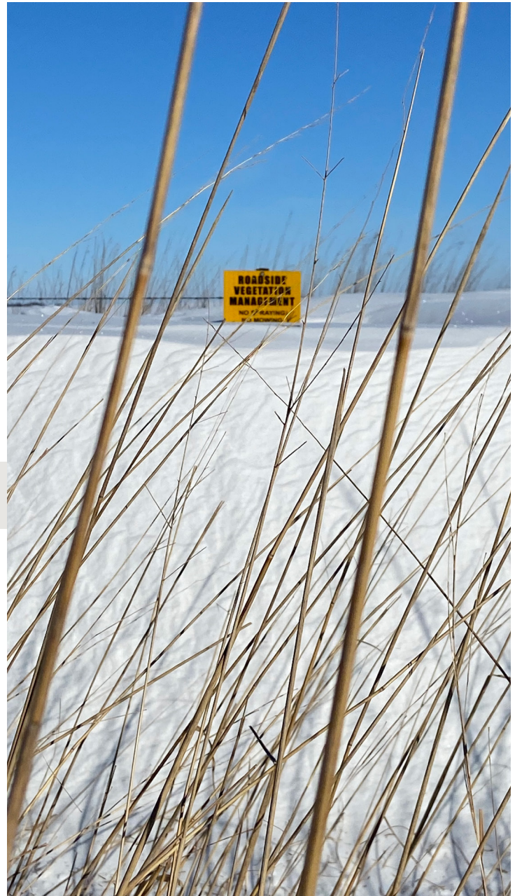
Roadside prairie grasses retaining snow. Prairie grasses are better able to retain snow under certain topographical and weather conditions.

To learn more about native seed, attend our annual roadside conference, or obtain example job descriptions and interview questions for a roadside manager, contact IRM program manager Kristine Nemec at kristine.nemec@uni.edu or 319-273-2813.