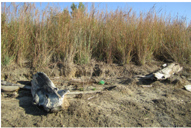
The roots of native prairie grasses protected the Mormon Bridge Embankment from erosion during the 2011 Missouri River flood; these photos were taken shortly after the floodwater receded.