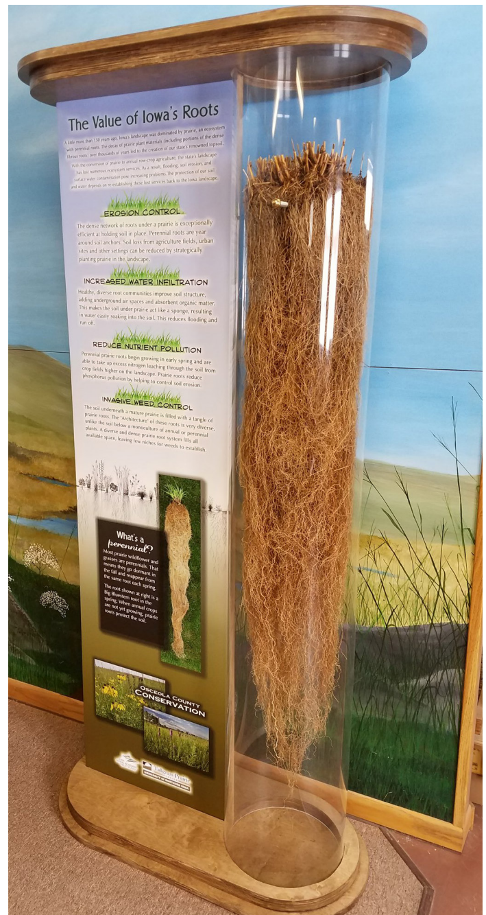
Dense, fibrous prairie roots are effective at slowing down the spread of weeds, improving water quality, and reducing soil erosion.

Helps with Derecho Cleanup." Last modified August 18, 2020. https://www.nationalguard.mil/News/Article/2316019/iowa-national-guard-helps-with-derecho-cleanup/